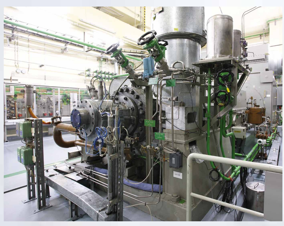
Boiler feed pump at the power station operator E.ON, equipped with EagleBurgmann DFSAFI.

Before the DiamondFaces® coating was used, it was tested under scientific conditions and with the original fluid as part of a project undertaken jointly by EagleBurgmann and the Technical University of Graz in Austria. After more than 10,000 hours of continuous operation without any signs of electrical corrosion on seal face or seat, it was then possible to go on to successful practical application of the seal solution together with E.ON.